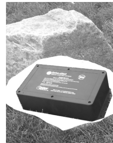
Under a DA-ROCK1 fake rock next to the drive