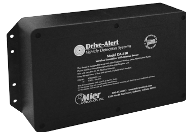
DA-610TO Sensor/Transmitter with internal sensor