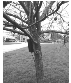
DA-611TO transmitter box in a sturdy tree for greater range