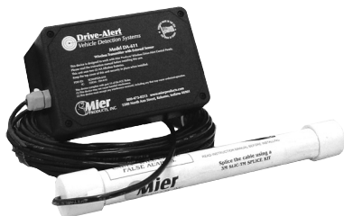
DA-611TO Sensor/Transmitter with external sensor