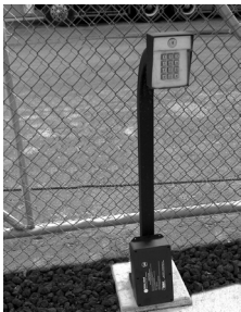
At the base of a pole