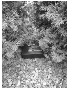
Under landscape next to the drive