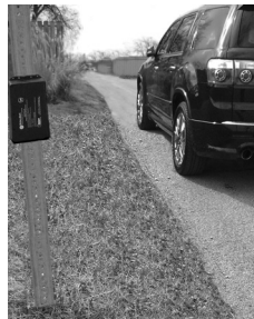
3-foot high for greater range