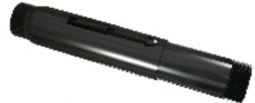
Adjustable drop length pipe available in three different sizes for perfect placement