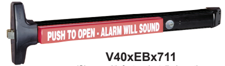
V40xEBx711 (Shown with factory installed mortise cylinder - sold separate)

Wide Stile shown, for Narrow Stile, specify NS Option (for use on 36" and 48" doors with 2" stiles).