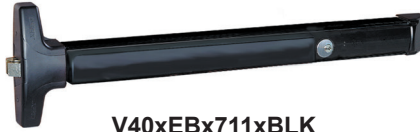
V40xEBx711xBLK (Shown with factory installed mortise cylinder - sold separate)