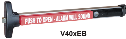
V40xEB (Shown with factory installed mortise cylinder - sold separate)

The V40xEB/EH is designed for primary and secondary exits that require an alarmed panic device . The 100dB alarm will sound when someone attempts to exit, alerting management to the unauthorized exit. Available in various configurations, the V40xEB/EH provides security while meeting all life safety concerns, offering an exceptional value.