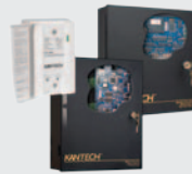
Kantech Door Controller Family