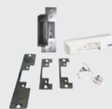
DK-1 Door Hardware Kit