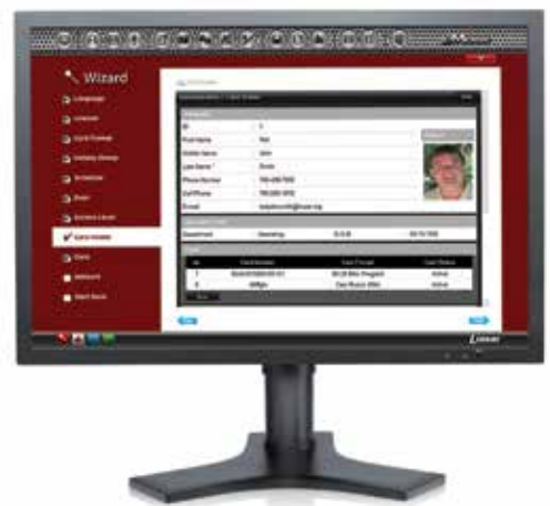
Quick-Start Setup Wizard: Saves Hours of Time Getting You Up and Running