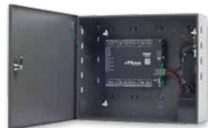
eMerge Essential Plus™

The comprehensive wizard is fast and intuitive, saving significant set-up time. Both the Essential and Essential Plus can be seamlessly scaled up, via software keys, to other eMerge E3-Series systems providing increased door and reader capacity, enhanced features, and higher level capabilities. The eMerge E3-Series makes expansion easy.