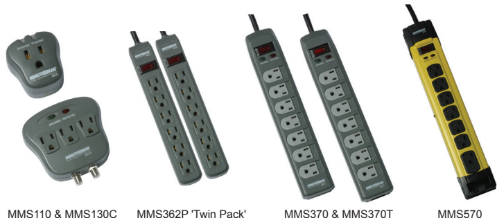
MMS110 & MMS130C MMS362P 'Twin Pack' MMS370 & MMS370T MMS570