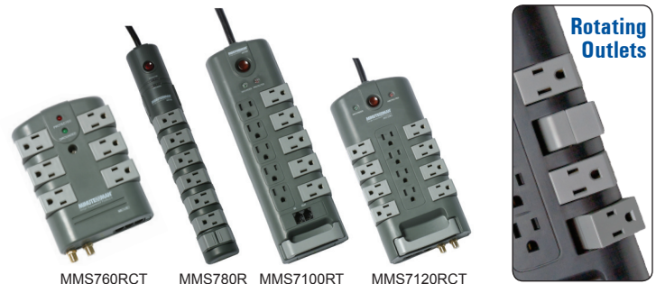
MMS760RCT MMS780R MMS7100RT MMS7120RCT