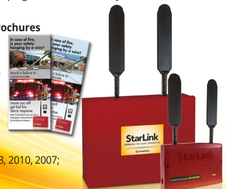
BROAD RANGE INCLUDING MERCANTILE MODELS

StarLink NAPCO Security Technologies, Inc. 1-800-645-9445 • 1-631-842-9400 • fax: 1-631-789-9292