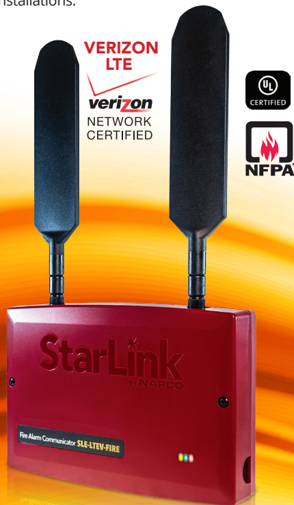
SLE-LTEV-FIRE CELLULAR MODEL or SLE-LTEVI-FIRE CELL/IP

COMPLIANCES: NFPA 72 Editions: 2016, 2013, 2010, 2007; UL 864, 10th Ed., UL1610, UL985, UL1023; NYCFD; CSFM; LAFD