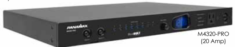
M4320-PRO (20 Amp)

BlueBOLT™ Provides Web Based Remote Power Management to Monitor and Control Your System - From Anywhere, 24/7.