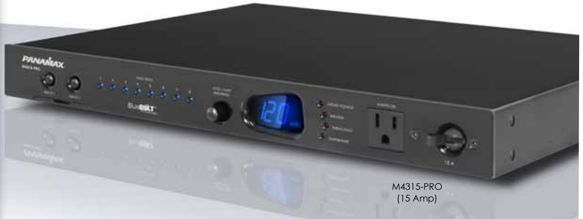
M4315-PRO (15 Amp)