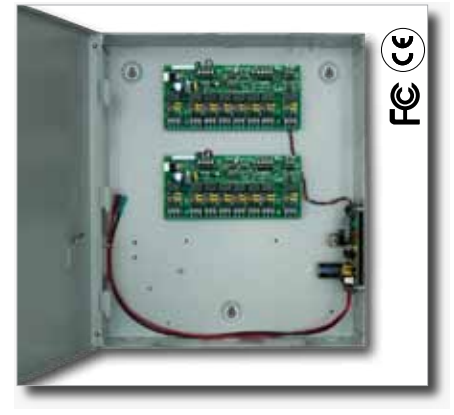
Two ELEV8 modules shown installed in an ENCL-1-PS enclosure.