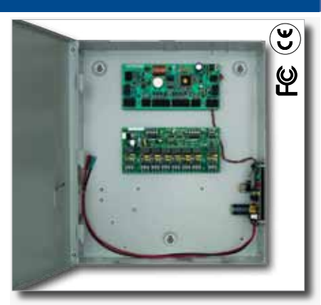
URC-2008 includes one URC-2000E controller and one ELEV8 module installed in an ENCL-1-PS enclosure as shown above