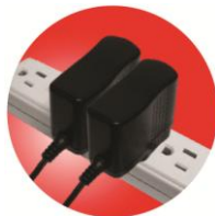
Fits Easily on Power Strips