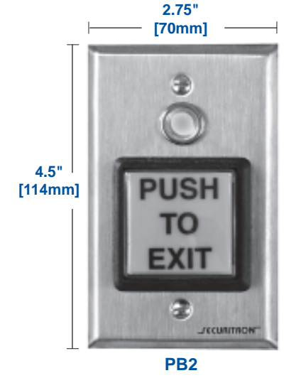
7 Amp Rated Contacts